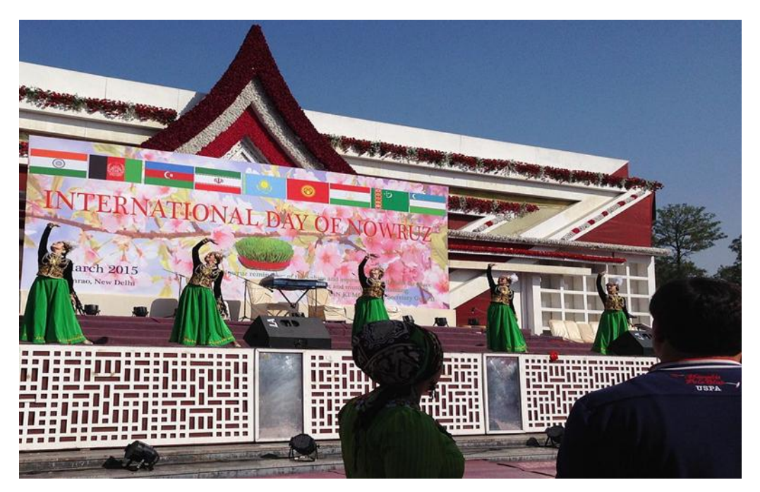
The First Nowruz Festival in New Delhi, 2015

In Iranian culture, Nowruz is reflected not only in nature, but also in language and literature.